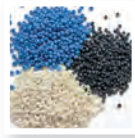
small beads in 3 colours