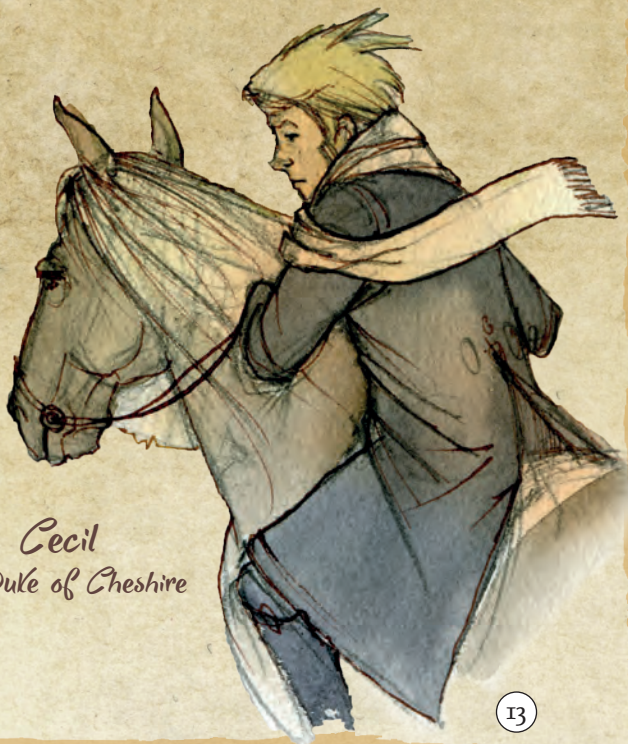
Cecil The Duke of Cheshire