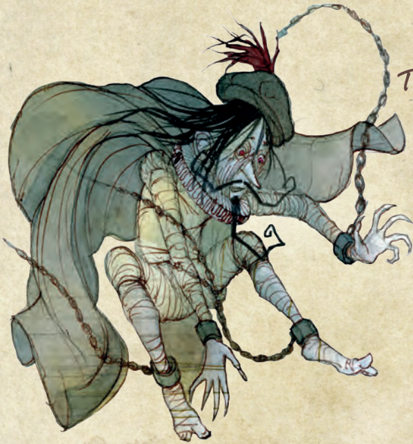
The Canterville Ghost