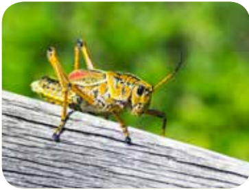
c r i c k e t