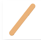
a lollipop stick