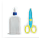
glue and scissors