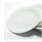
two paper plates