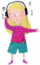
listening to music