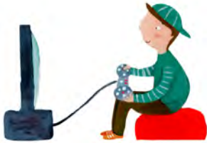
playing computer games