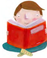
reading a book