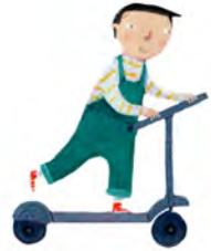
riding a scooter