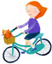
riding a bike

2 What do you like doing after school? Write.