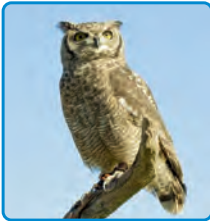
c Eagle Owl