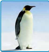
a Emperor Penguin