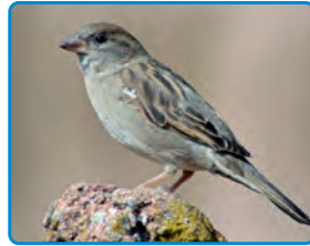
b House Sparrow