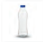
an empty plastic bottle