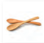
2 wooden spoons